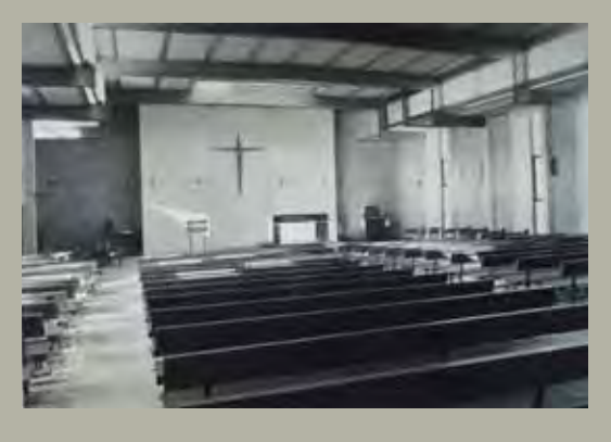
CHURCH OF THE INCARNATION, LINDISFARNE, 1967 L.W.JOHNSTON ARCHITECT

Research into the work of Dirk Bolt, significance assessment and architectural/urban design analysis, expert witness to RMPAT tribunal publication and media interviews on Tasmanian Modernisn.