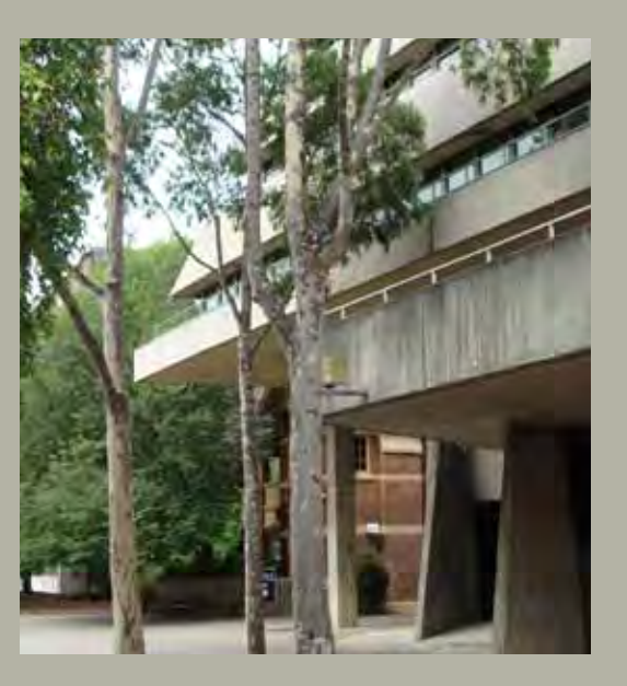
HENTY HOUSE, STATE OFFICES, LAUNCESTON 1982 PETER PARTRIDGE PWD ARCHITECTS

Research and citation documentation for THC nomination.